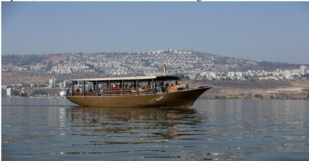
Replica of Wooden

Then visit Mensa Christi - John 21:1. After the visit drive to the River Jordan (Yardenit) site for baptism, return to our hotel for dinner and overnight.