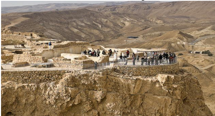
Massada

Return to Jerusalem for dinner and overnight.