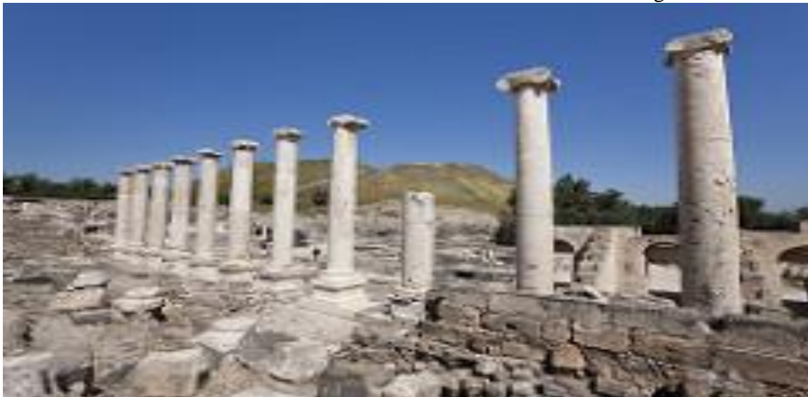
Beit Shean

This morning we'll leave the sea of Galilee. Drive along the Jordan Valley to Beit Shean and then passing Jericho , the world's oldest city. Just beside the wall of Jericho, to the east, is the fountain of Eliseus. It was here the spring's bitter waters were turned sweet by the prophet's handful of salt (21 Kings 2: 19). From here the Mt. of Temptation can be seen On to Jerusalem. Drive to our hotel in Jerusalem for dinner and overnight.