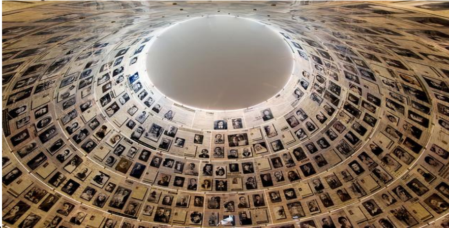
Yad Vashem

Continue to Ain Karem the birth place of John the Baptist, then to our hotel for dinner and overnight